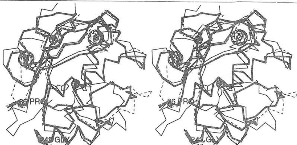
Figure 2. A stereo view of the experimentally determined model of human fibroblast collagenase, MMP-1 (dashed lines), superimposed with the RIGID command over a C \alpha model of human MMP-8.

superimposed in Fig. 3. these results confirm the current capabilities of Internet to link data bases and extract knowledge from information; they also demonstrate how a