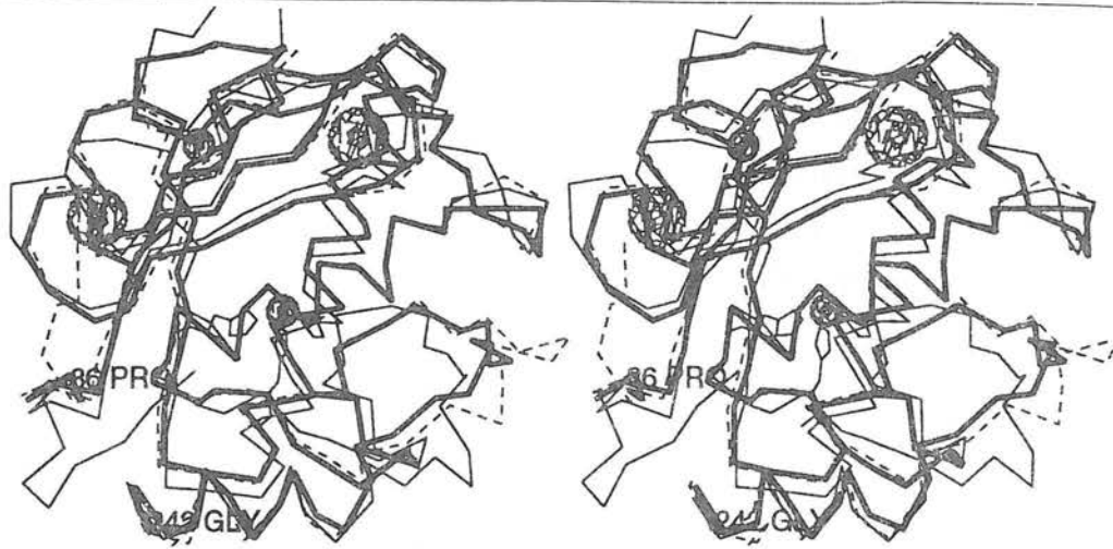
Figure 2. A stereo view of the experimentally determined model of human fibroblast collagenase, MMP-1 (dashed lines), superimposed with the RIGID command over a C \alpha model of human MMP-8.

superimposed in Fig. 3. these results confirm the current capabilities of Internet to link data bases and extract knowledge from information; they also demonstrate how a